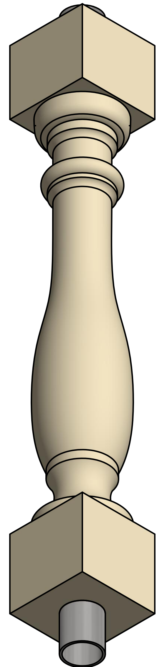
3D SCALE 1 / 2

NOTE 1: MEASUREMENTS TAKEN FROM PRODUCTION PARTS. DRAWINGS MAY VARY SLIGHTLY FROM ACTUAL PARTS.