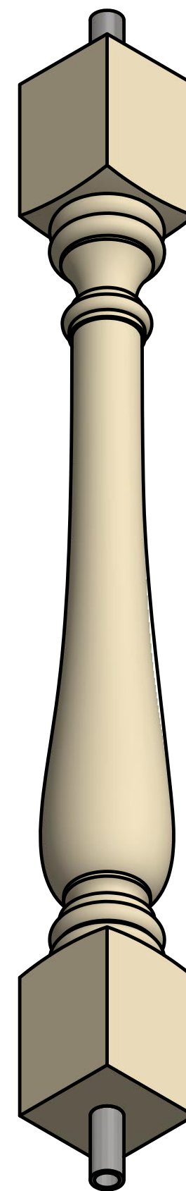
3D SCALE 1 / 3

NOTE 1: MEASUREMENTS TAKEN FROM PRODUCTION PARTS. DRAWINGS MAY VARY SLIGHTLY FROM ACTUAL PARTS.