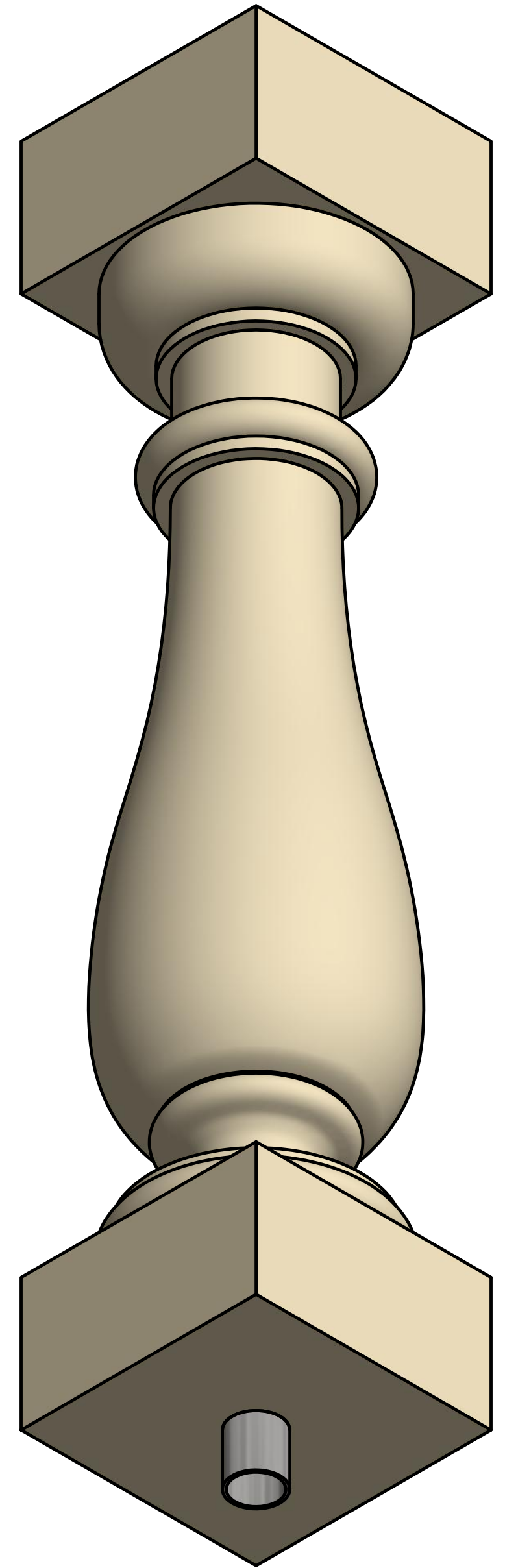
3D SCALE 1 / 3

NOTE 1: MEASUREMENTS TAKEN FROM PRODUCTION PARTS. DRAWINGS MAY VARY SLIGHTLY FROM ACTUAL PARTS.